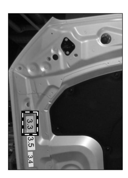
Figure 3 (Model 238)