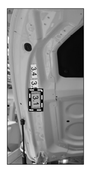
Figure 4 (Model 257)