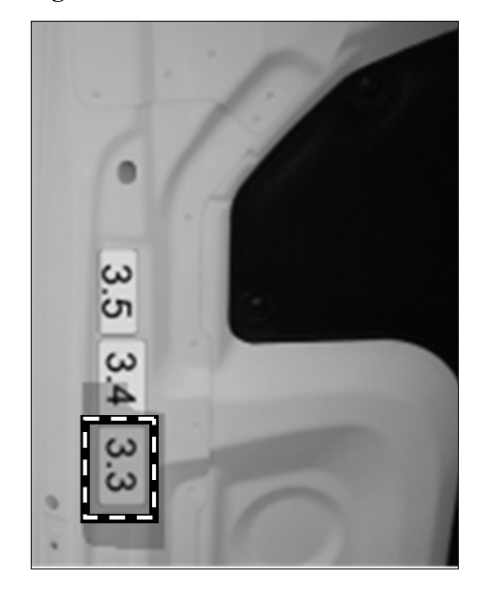
Figure 2 (Model 213)