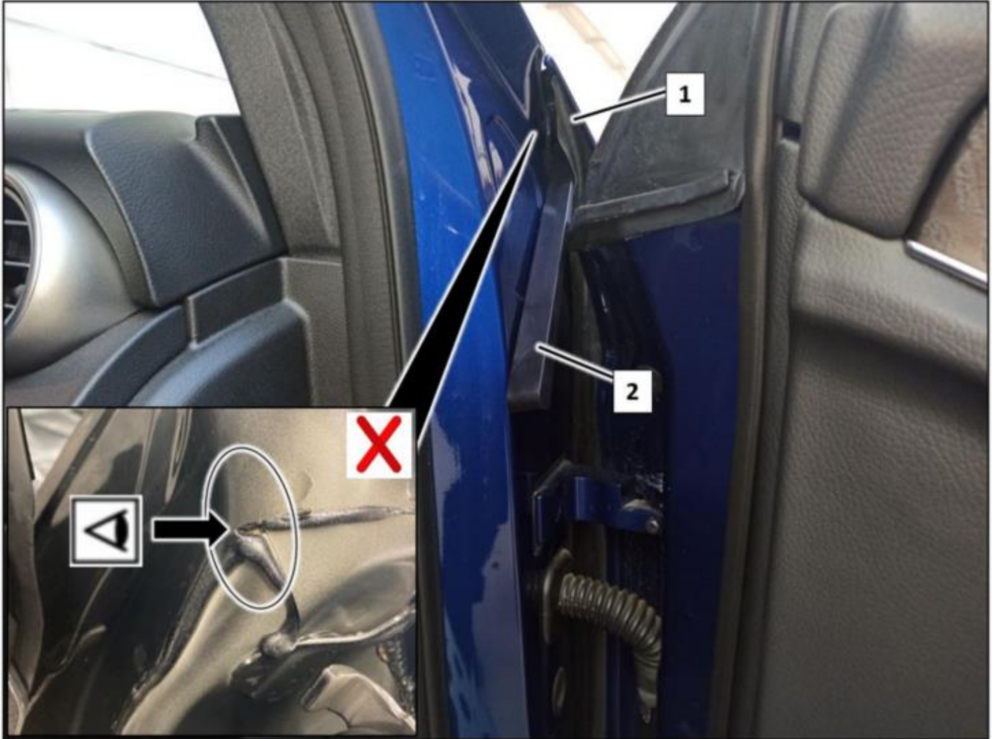
Figure 1: Example of seam seal with defect.